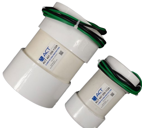
ACT 447-350-112 60 Hz Filter / Protector